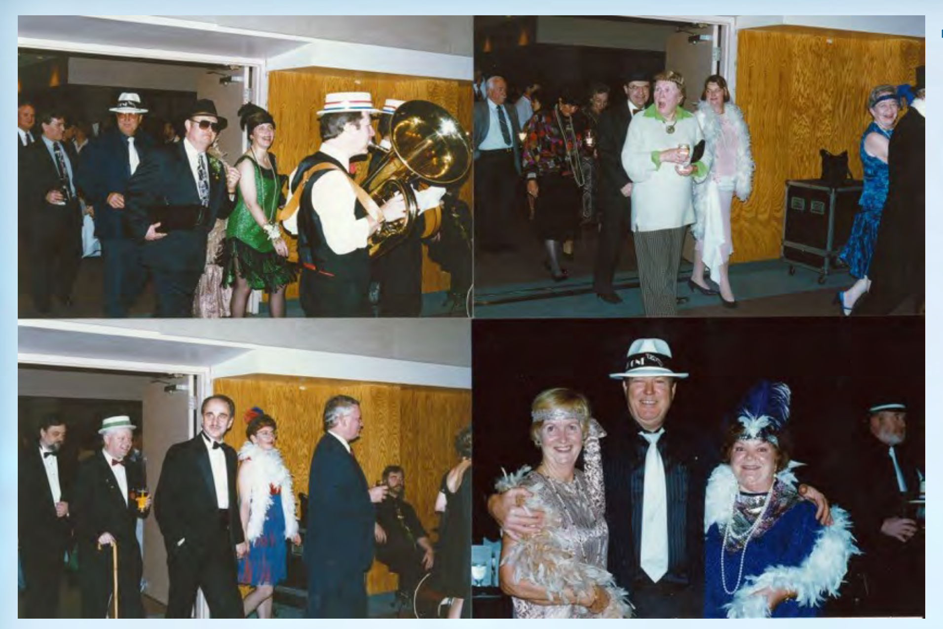
To celebrate the Institute's 75 Anniversary, AGM delegates dressed in 1920s style clothing.